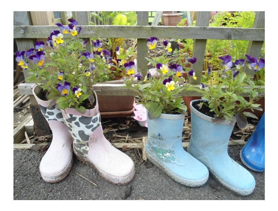
The children also grew nasturtiums and heartsease which are edible and attractive to wildlife!