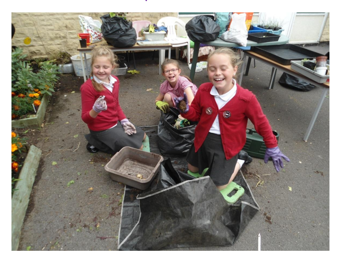
The children really enjoyed discovering The creamy white potatoes.