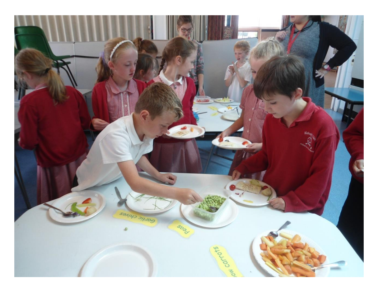
The peas were very popular.

The children help themselves to the produce that was harvested only the day before.