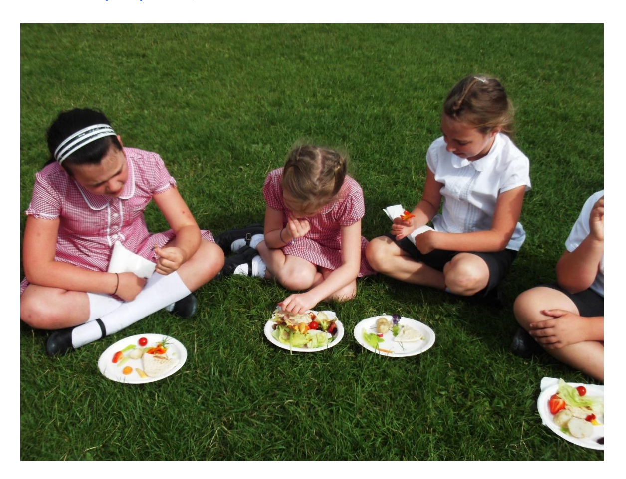
The children enjoyed tasting the fresh, crunchy flavours during a picnic on the school field.