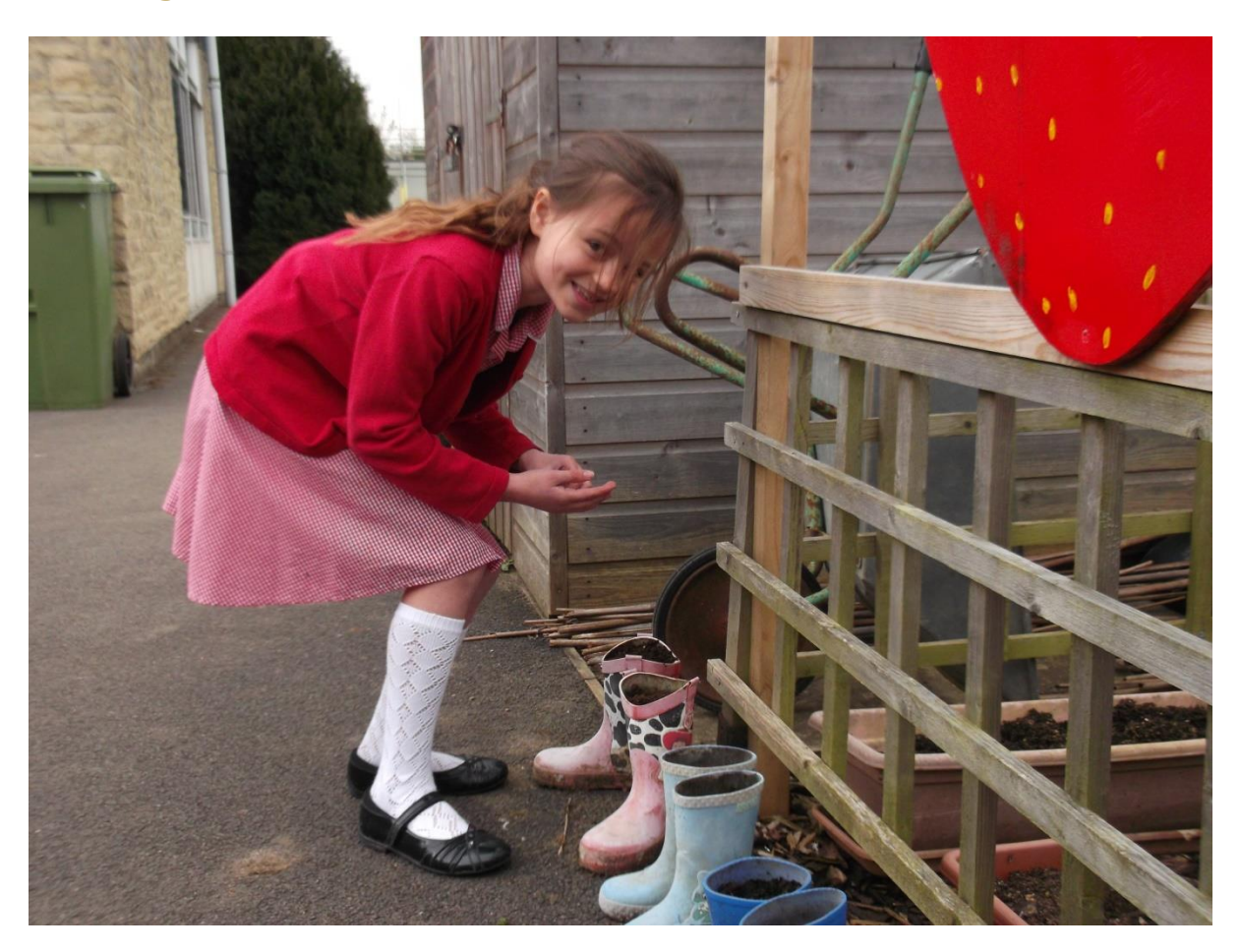
Sowing heartsease in the wellies