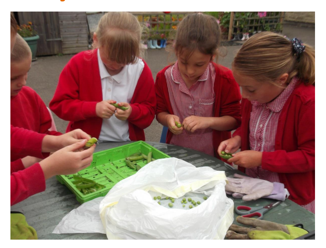
Shelling the peas.