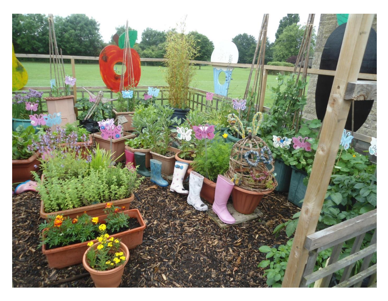
The caterpillar's head is full of red lettuce!