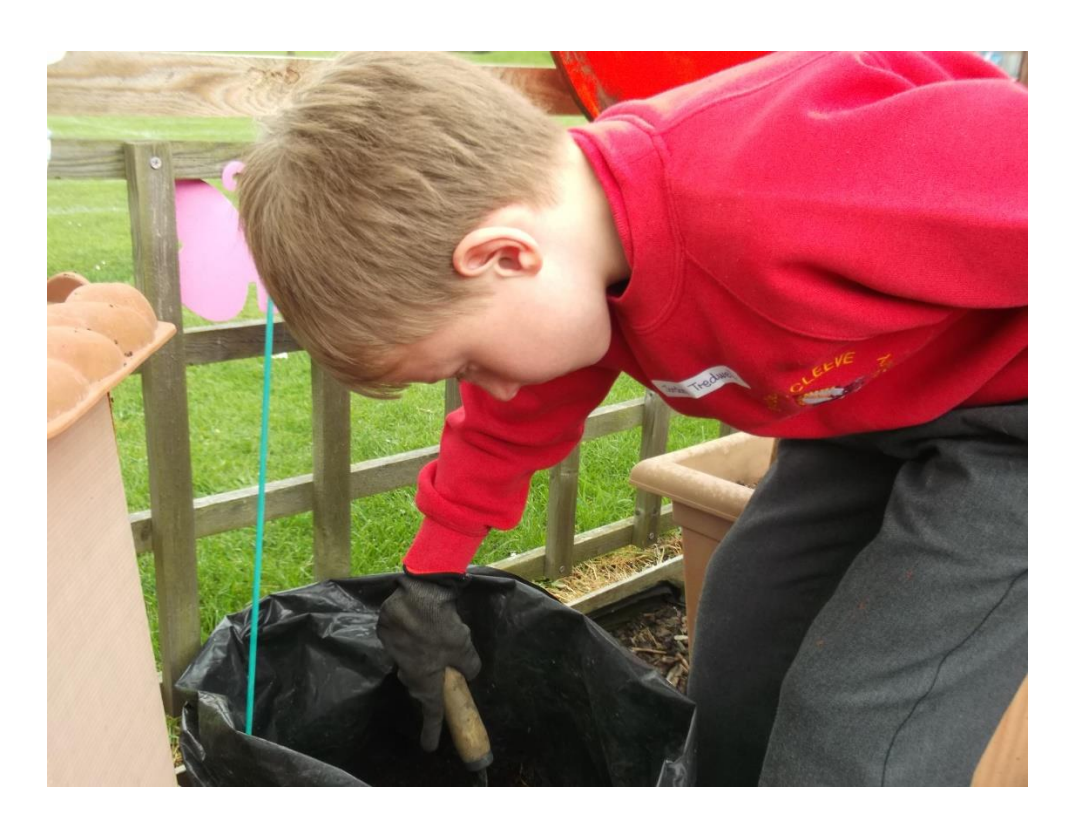
Planting seed potatoes