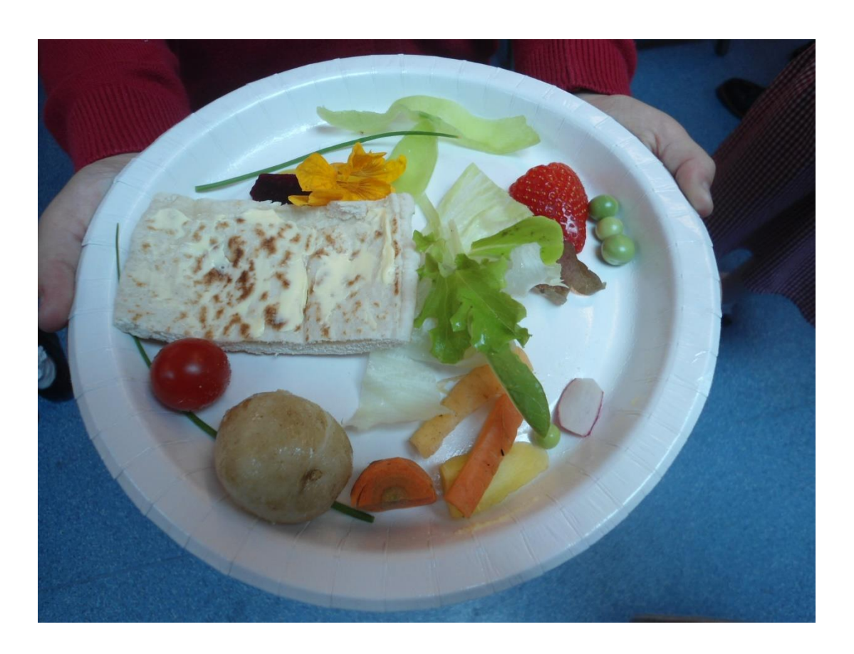
A colourful feast!