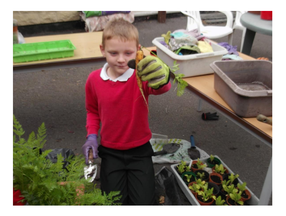
This photo shows a good sized rainbow carrot.