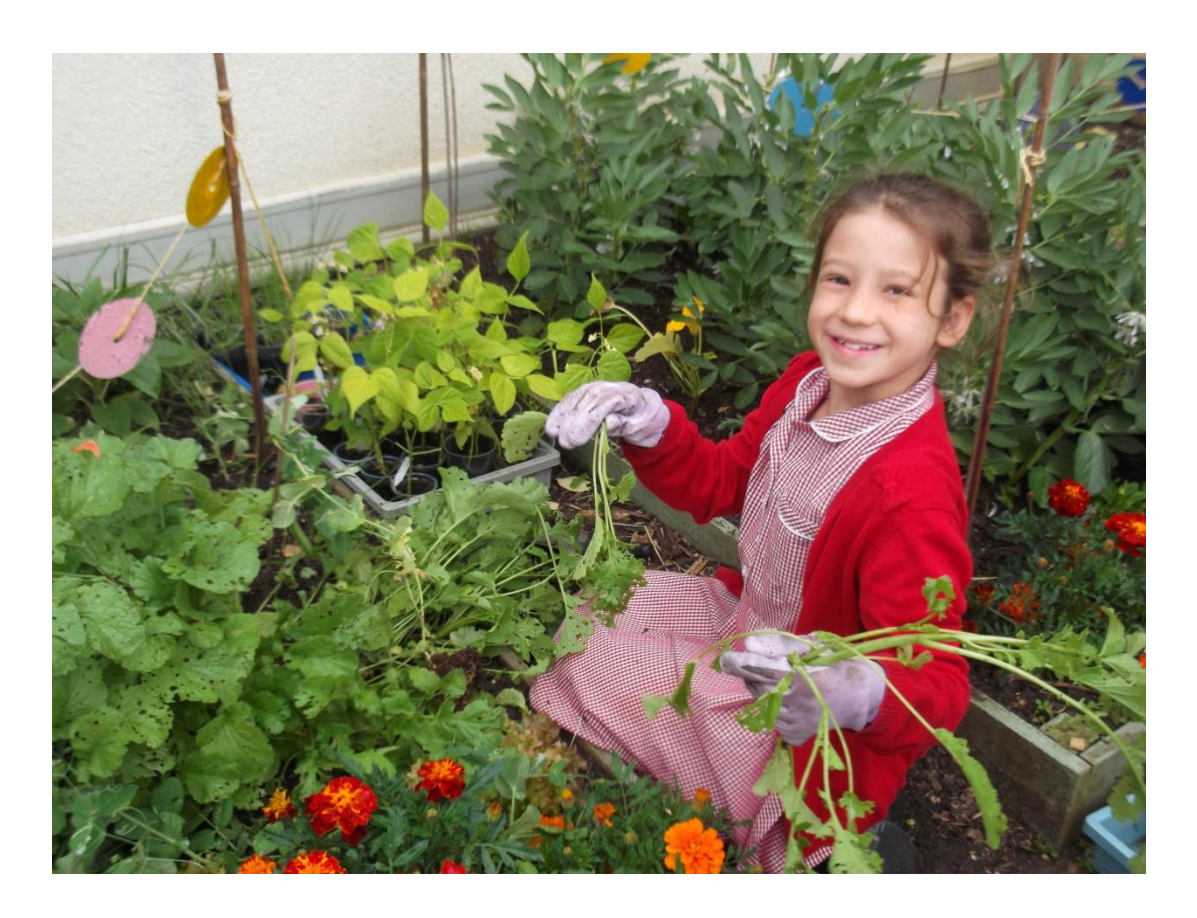
Harvesting the radishes.